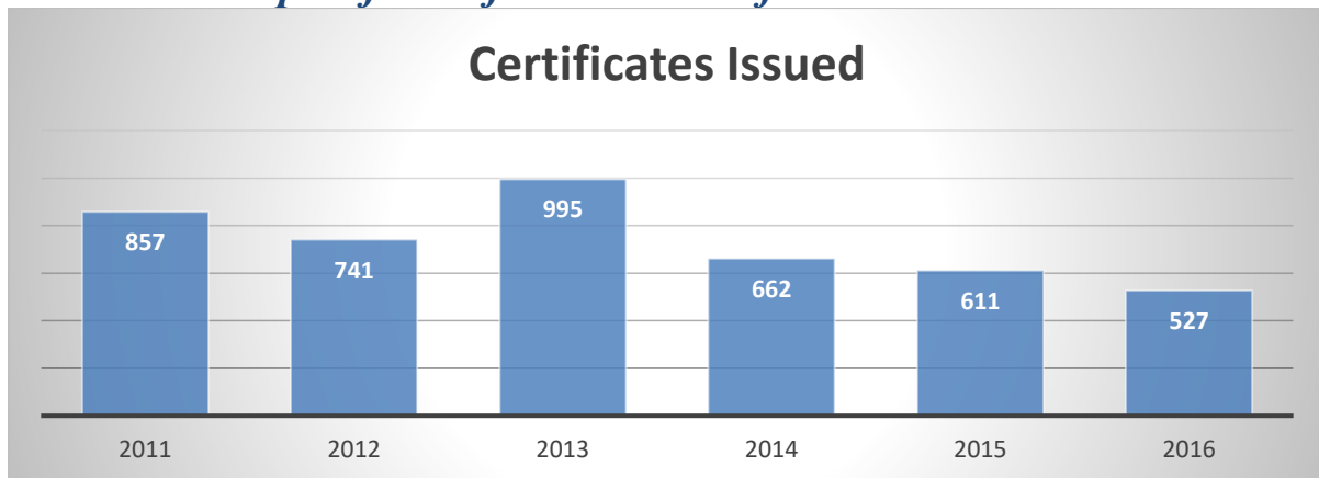
Graph of Certificates Issued from 2011-2016